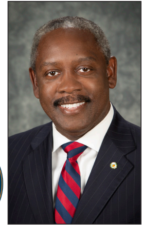
Jerry L. Demings Orange County Mayor